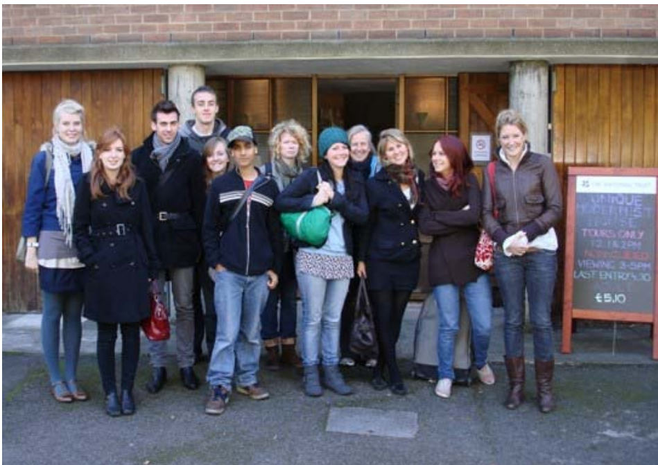
Figure 1 University of Brighton 3D design students at 2 Willow Road, October 2008

The outcome of this research was the decision to focus on Web 2.0 applications, such as Elgg Community@Brighton and Flickr, as the most participative means of involving design students in learning from archives. A recommendation to the partner archives to consider disseminating their collections through various online channels, rather than following traditional exclusive image licensing practices, concludes the report.