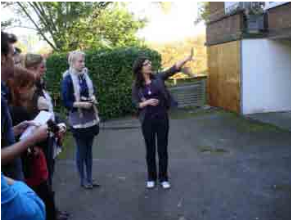
Figure 4 National Trust curator with University of Brighton students at 2 Willow Road

Our research has revealed the high degree of interest in the application of Web 2.0 technologies in an academic context, an interest that is reflected across the CETLD partnership from Community@Brighton to the RCA's Moodle environment. Museums, libraries and archives, such as the V&A and the Library of Congress, are increasingly involved in interacting with their audiences through social media like Flickr, built around communities of interest. They are also exploring how to disseminate their collections within these social networks. Our project was therefore at the crossroads between the trend towards participative environments in art and design education and the desire of museums and archives to reach wider audiences through social networking technologies.