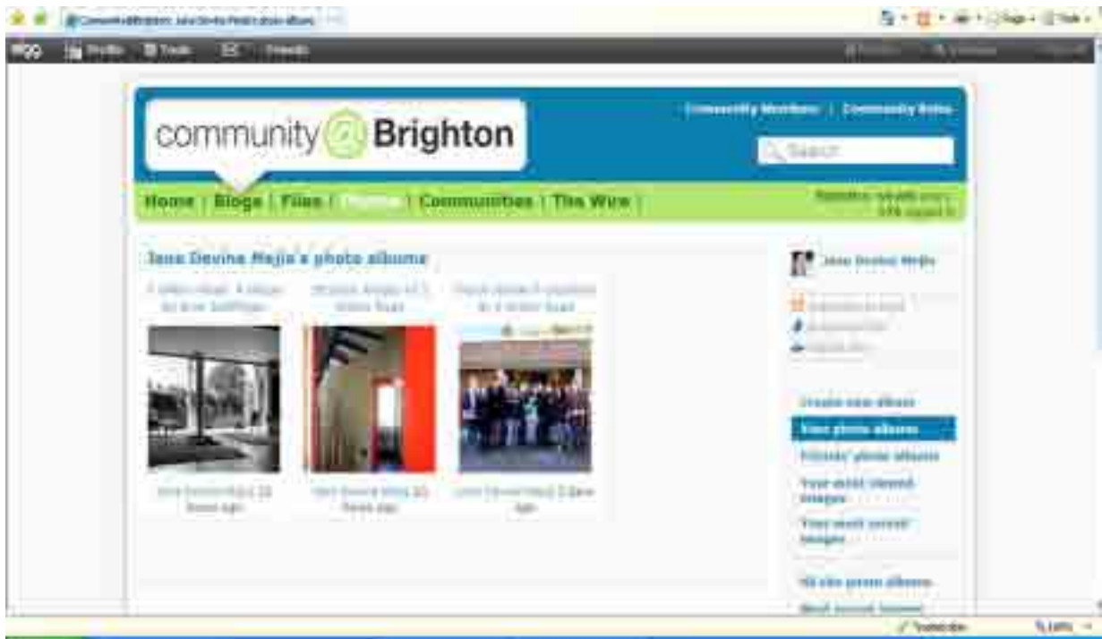
Figure 5 Albums of 2 Willow Road archival material and student images on Community@Brighton