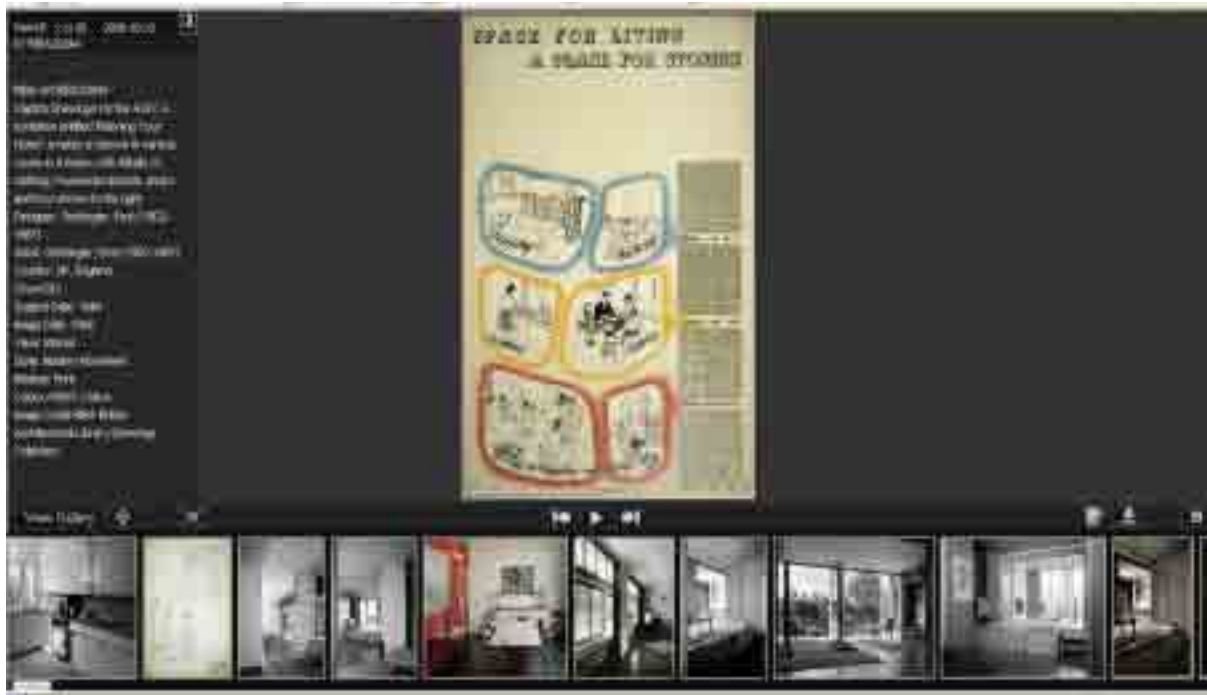
Figure 2 Fotoplayer prototype, showing images from the RIBA and University of Brighton Design Archives. Image metadata is displayed in the lefthand column.