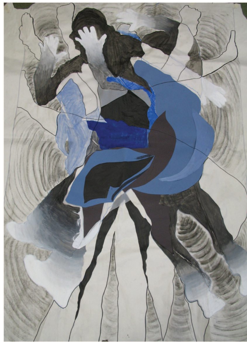
After drawing round positions of the body in a doorway I coloured the image to show the dynamic, circular shapes that emerged.