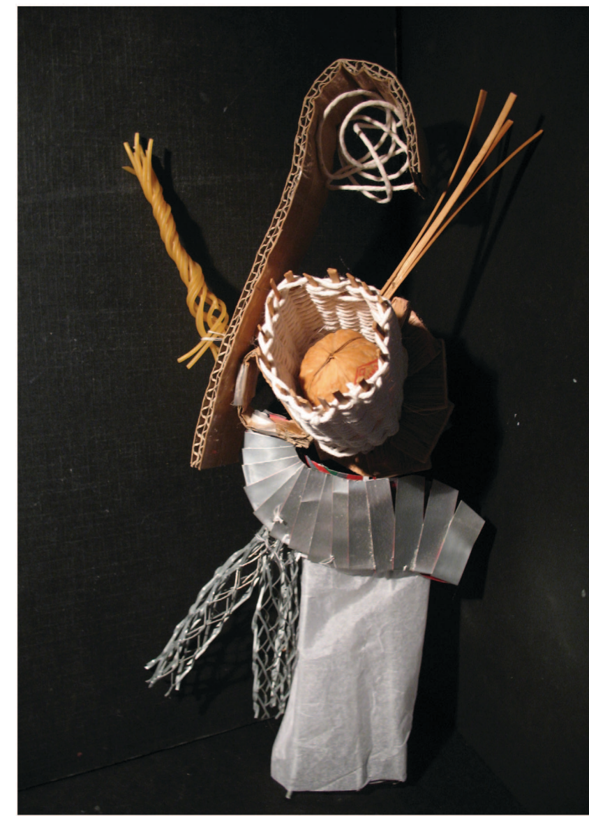
The images above and below are copies of the 3D paper model but made from different materials such as wood, cans, and string, hence involving new construction methods. The model was also required to house a walnut so a space developed for this in the centre where the structure is denser and most stable.