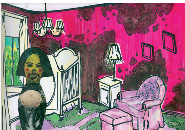
Nurtane Karagil. Bebeka 2 .

The MA Fine Art Degree Show will be located in the ground floor exhibition space at 58-67 Grand Parade. The MA Interim Show of part-time students' work will be taking place simultaneously in the studios on the second floor. A total of thirty artists will be showing in the exhibition. Entrance is free.