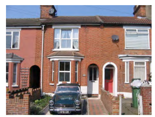
Fig. 19: The Victorian example above show side-by-side paths separated and connected by a low wall. The individual entries are defined by recesses raised off the level of the tiled walkway.