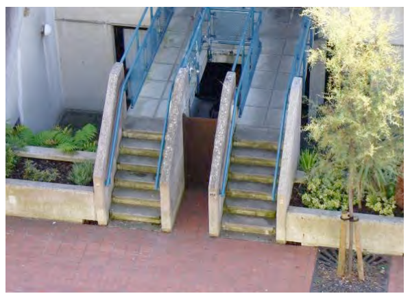
Fig. 3: View of parallel stair and bridges leading to lower maisonettes, block B. Note the blocked off entry to the lower level between the stair.

There is also a choice available between entering the upper public level (kitchen, living & dining) or the lower private level (bedrooms). The use of one or the other may depend on habit or personal preference; for example, arriving home from work or school some may find it preferable to enter the lower level to change or shower before engaging with the rest of the family. Alternatively, if arriving with groceries others may use the upper route leading to the kitchen. Some might restrict entry to the upper level through habit or social convention. That is, the upper level could be coded 'front' and the lower level 'back' and reinforce this interpretation though use. As such some users may 'abandon spatial elements...' by not taking 'paths generally considered accessible or even obligatory'.<sup>35</sup> The spatial configuration is significant in allowing both traditional as well as divergent readings and practices.