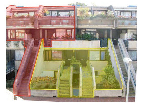
Fig. 24: Interlocking of paired units