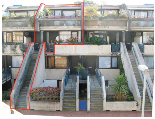
Fig. 23: Outline of upper unit and stair