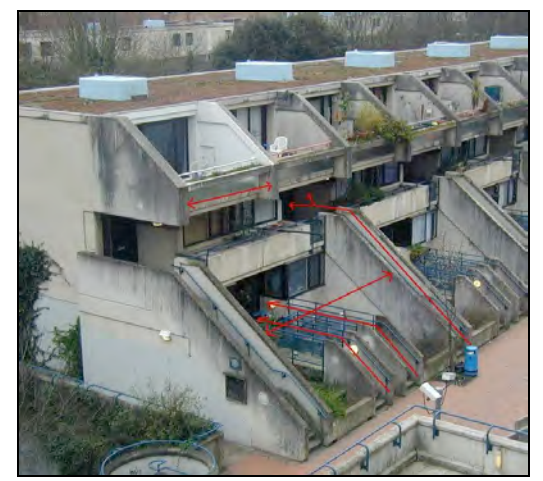
Fig. 1: View of block B, Alexandra Road. Red arrows indicate individual and shared entries to lower and upper maisonettes. The wider space below demarcates the shared 'forecourt' space of two units while the expressed cross-walls of the upper units identify individual units. One can also enter the lower level of the bottom unit in the gap between the parallel stair-bridges.

The outline above has tried to both reveal a gap in spatial awareness while also arguing for the importance of spatial forms. What follows is a sketch analysis of the entry sequence of one of the blocks in Neave Brown's Alexandra Road housing project in Camden, London (1968-78). These notes are part of a larger study, which articulates the reasons for examining this particular estate as well as others. There is no room here to go into detail – I will only note that the position this project occupies between the replication of traditional forms of housing and access and their reinvention provides a unique opportunity for examining spatial forms and practices. The method employed is not intended to represent a fully formed analytical approach. I hope, however, that it is suggestive enough to demonstrate the importance of some of the issues raised above.