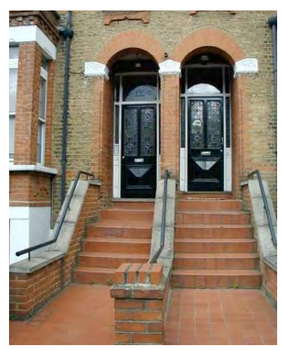
Fig. 20: Another Victorian example, above, with parallel entries utilising recesses and low walls unifying the paired units and providing identity to individual dwellings.

Fig. 19: The Victorian example above show side-by-side paths separated and connected by a low wall. The individual entries are defined by recesses raised off the level of the tiled walkway.