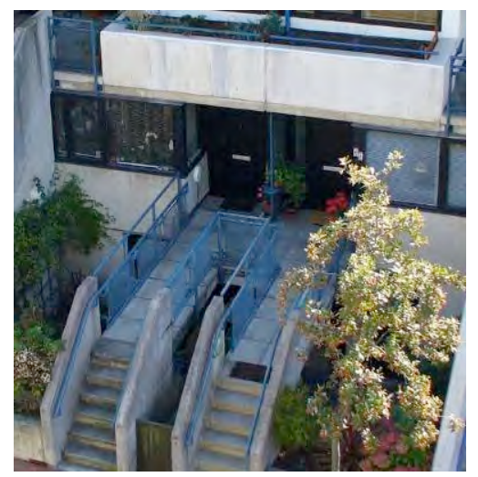
Fig. 4: unmodified entry

landing has been used for storage in a manner that does not clearly establish ownership or a boundary ( Figs. 4, 5 & 6 ). Others have been left in their original state.<sup>36</sup>