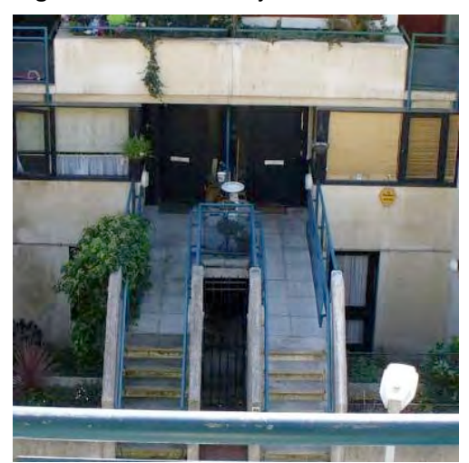
Fig. 6: Landing with barbeque and potted plants – there is no clear indication of which unit owns the objects arranged in the middle

The lower level accesses have also been modified with screens, gates and partitions (Figs. 7-18). These different treatments provide different levels of privacy for the lower court. Some are full height while others are low and flimsy sheets of plywood that act more as symbolic barriers. In a few cases tenants have installed gates which have some affinity with the surrounding metalwork.<sup>37</sup> Here we could read the form of the additions as constructing new but precise relationships between the lower court and street. That is, some block access and views, while others only prevent access. Low and flimsy barriers block neither access nor view but make a clear statement which entry is primary and to be used by visitors.