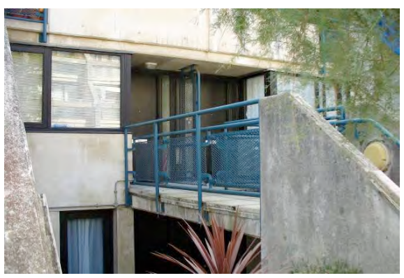
Fig. 2: View of bridge leading to front doors of lower maisonettes, block B.

parallel set of stairs and bridges leading to an upper level landing and a shared entry leading to the lower level ( Figs. 2 & 3 ). One can easily identify a stair-bridge combination with an individual dwelling. However, there is nothing to prevent someone from using an adjacent path and crossing over to their front door on the landing, thus interpreting and practicing the entry sequence as shared access.