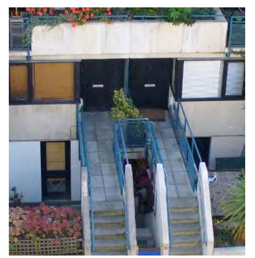
Fig. 5: landing screened by plants