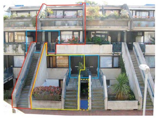
Fig. 25: Entry and unit overlap

To be clear, this is not a visual or compositional game. The act of climbing the stairs to the upper dwellings of block B inscribes with one's body the shared thick boundary between two units. To cross the bridge to one of the lower dwellings is to express your individual trajectory to 'your' dwelling while passing through the shared space of a pair of units. As suggested by Thrift, it becomes difficult to separate out bodies and things, practices and spatial forms. The meaning and experience of arrival cannot be found by looking at spatial forms or spatial practices in isolation. Rather, it is possible to conceive of spatial forms and practices as an irreducible figure in itself.